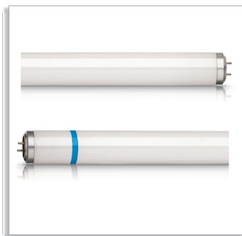
TL-D (K) Secura